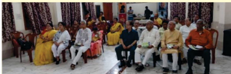
Always attentive at the RWMs