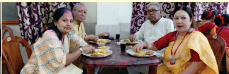
Loves to attend Family of Rotary Project ( Holi )