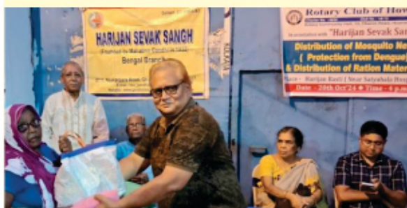
Representing RC Howrah Project at Harijan Sevak Sangha