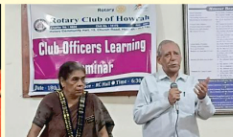
Presenting his plans & programmes at COLS