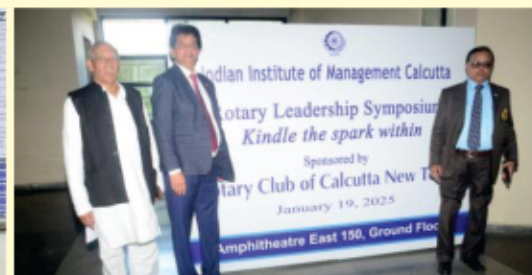
Attended PETS-1 at IIM Kolkata