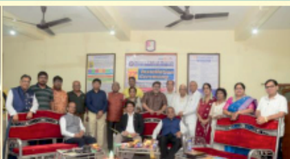
He was introduced as Board member at last Installation