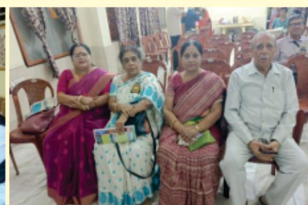
With VP & Outgoing President at last RWM of R.Y. 2024-25