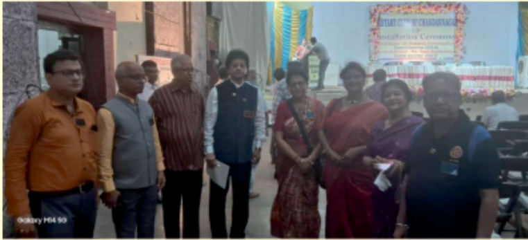
All RID 3291 invitees were in a frame on that evening