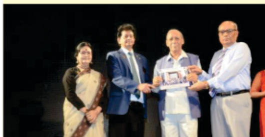
Graduated at PETS 2025-26