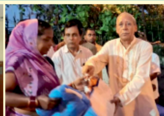
Participated at RC Howrah Project