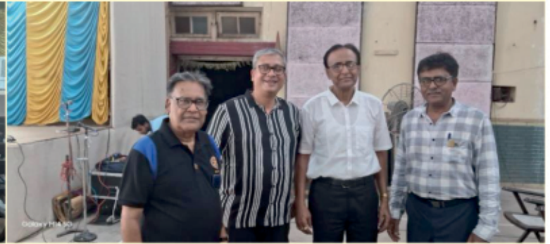
With president of RC Chadannagar 2006-07and 2025-26