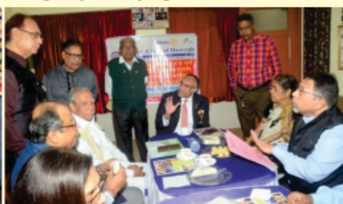
In discussion with DG at his official club visit